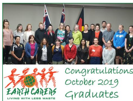
Earth Carers 2019 Graduates

A range of topics are covered, including composting and worm farming, Green Cleaning and correct disposal of hazardous and other waste. On completion of the program, Earth Carers are equipped with knowledge about how to reduce waste at home and encouraged to start projects in their local community. At the EMRC we value our Earth Carers enthusiasm and commitment to waste reduction and nurture this passion by providing special Earth Carers only events and training courses. If you would like to register your interest in attending a future Earth Carers course please call the Waste Education Team on (08) 9424 2222 or email WasteEducation@emrc.org.au