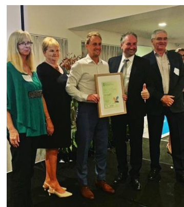
The EMRC team celebrate their recognition at the 2019 Western Australian Landcare Awards

The ERCMP also delivers workshops and experiences open to children from pre-school to high school. The Bush Skills 4 Youth (BS4Y) and Bush Skills for the Hills programs are designed to give participants the skills to manage and appreciate what local bushland has to offer. In 2018 BS4Y delivered 53 workshops to 1,547 children and 431 adults.