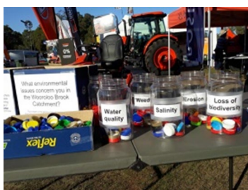
Community members vote on the landcare issue of greatest concern to them