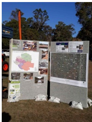
Information about the Wooroloo Brook catchment on display