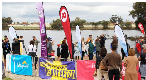
Excitement builds at Bayswater's Family Fun Day Event

This year, the EMRC again coordinated an extensive Avon Descent marketing campaign promoting six Family Fun Days organised by six participating Councils in Northam, Toodyay, Bassendean, Belmont, Bayswater and Swan from Friday 2 to Sunday 4 August 2019. These events provided the backbone of the regional marketing campaign and successfully engaged local communities and visitors with the Avon Descent race.