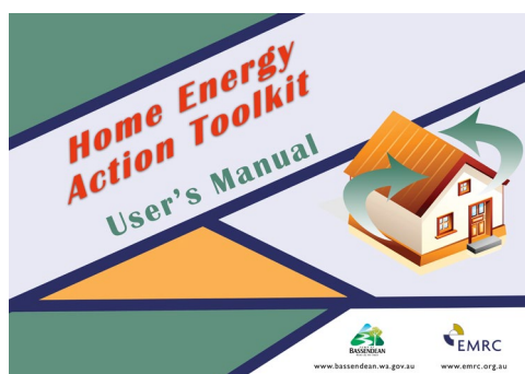
Updated HEAT cover

Not only does energy consumption have an environmental cost, it also costs us money. Australian Households use one-third of Australia's energy output. Approximately 40% of that consumption comes from heating and cooling your home.