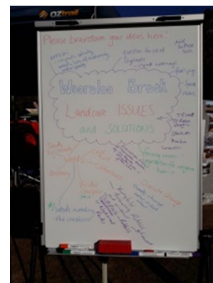
This community mindmap captures residents' landcare issues and solutions