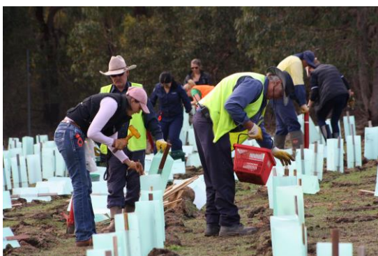
EMRC Staff Tree Planting Day

Over 50 staff took part in tree planting and together, managed to plant more than 2,000 tubestock in just over an hour. This is a remarkable effort by all involved and demonstrates the power and value of teamwork.