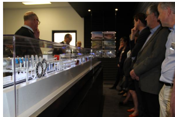
Model of the tunnel boring machines

Attendees provided some positive feedback on the Transport Advocacy Tour which covered the two interesting projects. Once completed, the Forrestfield-Airport Link and NorthLink WA will change the layout of Perth, and more importantly reduce congestion and travel time in key areas. The Forrestfield-Airport Link line will be open in 2020 and NorthLink WA will be complete in mid-2019.